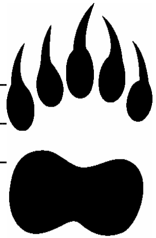
OFFICIAL BEAR PAW